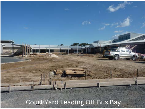
Court Yard Leading Off Bus Bay