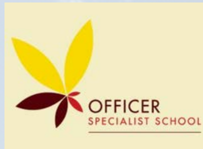
Original School Logo 2014 - 2021