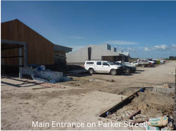
Main Entrance on Parker Street