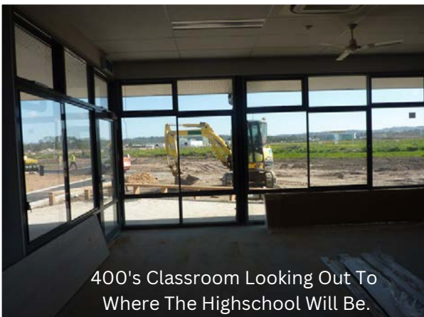
400's Classroom Looking Out To Where The Highschool Will Be.