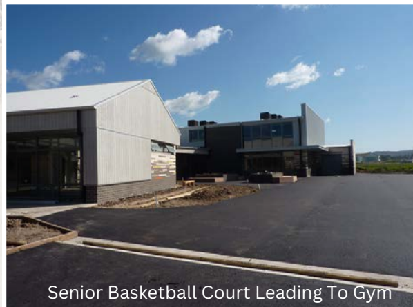
Senior Basketball Court Leading To Gym