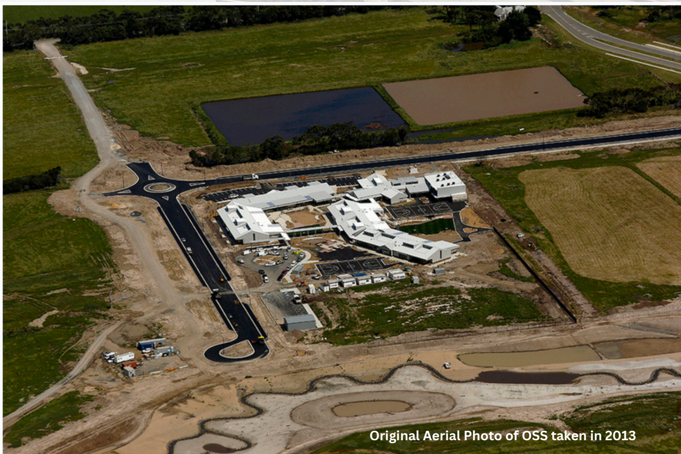
Original Aerial Photo of OSS taken in 2013