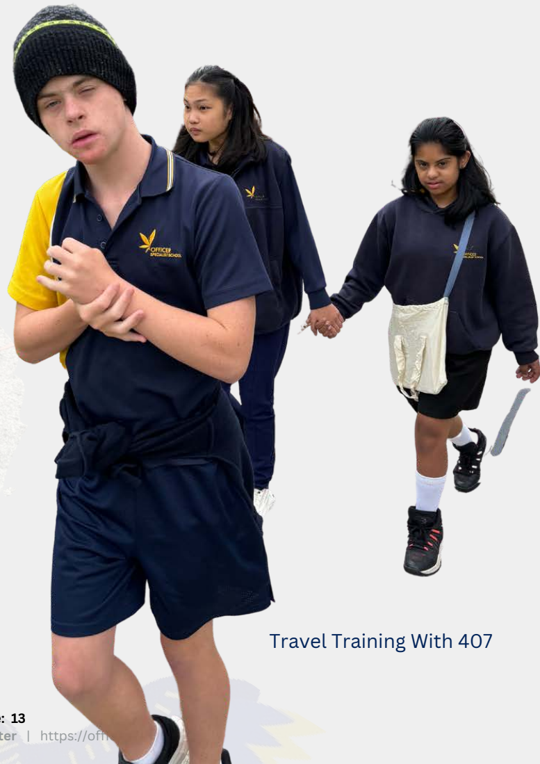
Travel Training With 407