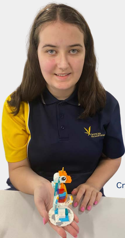
Creating Amazing Lego