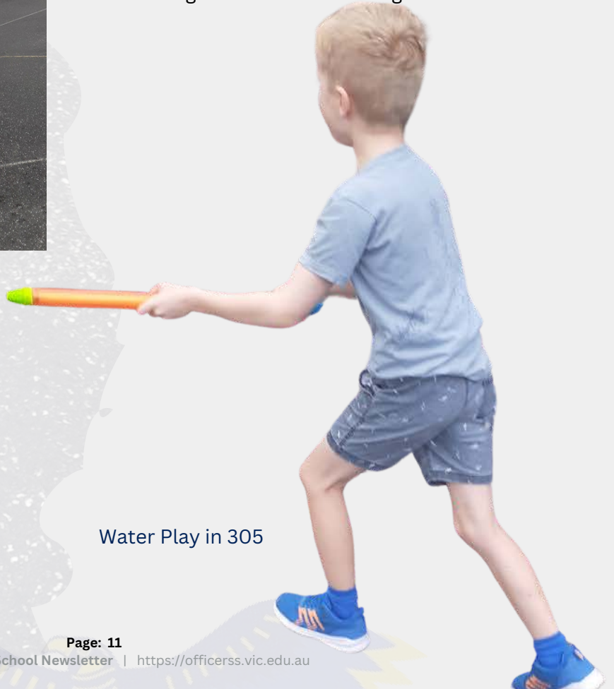
Water Play in 305