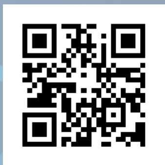
PHOTOGRAPHING, FILMING AND RECORDING STUDENTS' POLICY

Our school collects and uses student and parent personal information for standard school functions or, where permitted by law, as stated in the School's Privacy Policy and the School's Privacy Collection Notice. Please click on the link to Schools' Privacy Policy and information Schools' privacy policy: information for parents | vic.gov.au ( www.vic.gov.au ) Our Photographing, Filming, and Recording Students Policy ( http://tinyurl.com/3kmbcfk9 ), describes how we collect and use photographs, video, and recordings of students. The policy also explains when parent consent is required and how it can be provided and withdrawn.